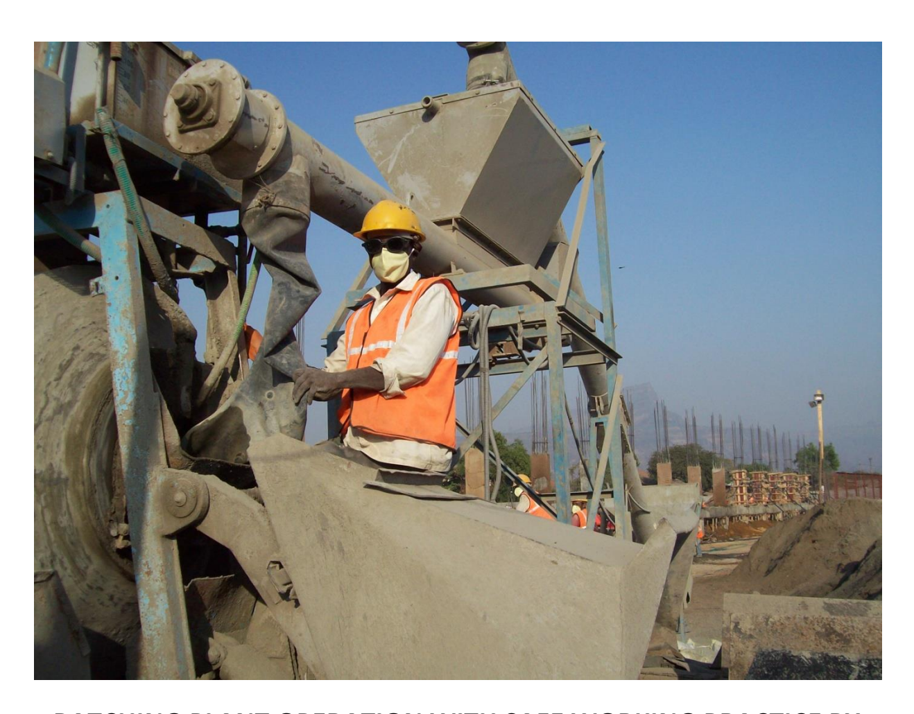
BATCHING PLANT OPERATION WITH SAFE WORKING PRACTICE BY USING PROPER PPE